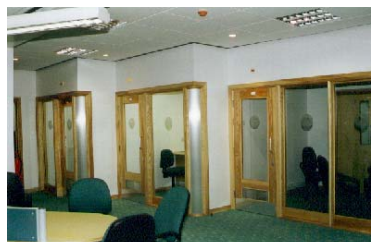
Customer Service Centre, Beverley