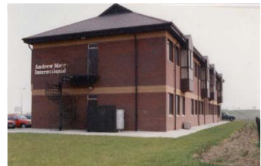
Andrew Marr International, Hessele, Hull