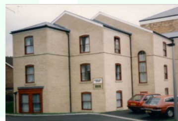
Normanby House, Scarborough

Sinclair is a household name in the Scarborough area, and has built up an enviable reputation for the quality of work it carries out.