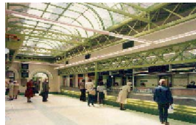
Paragon Railway Station, Hull