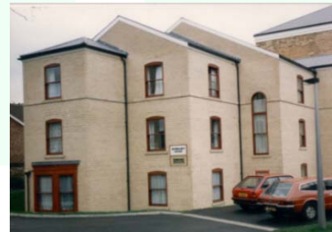
Normanby House, Scarborough