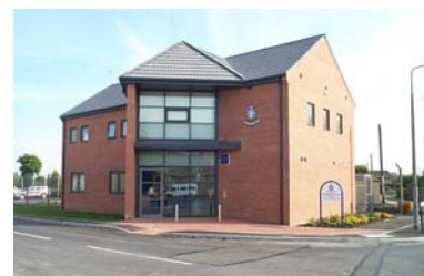
New LPT Base, Howden