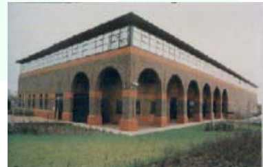
Fire Brigade HQ, Hessele, Hull