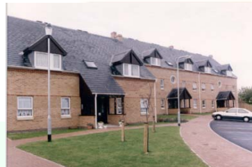
Wykeham Street, Scarborough

The Quibell Group acquired Sinclair in 1988, and they are now a stand-alone company within the Group.