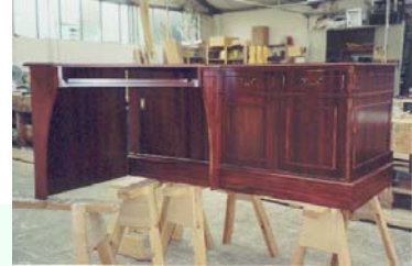
IT Desk : manufactured for private client

Manufactured items include windows, doors, mouldings, kitchen units, counters etc.