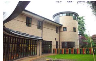
Tranby Girls' High School, Hull