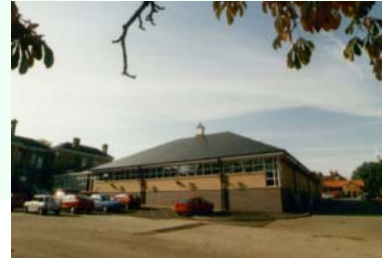
Willerby Manor Hotel