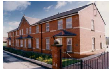
Freehold Street, Hull