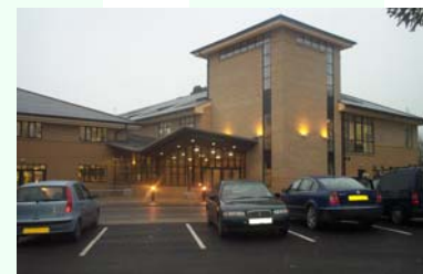
Hull Collegiate School