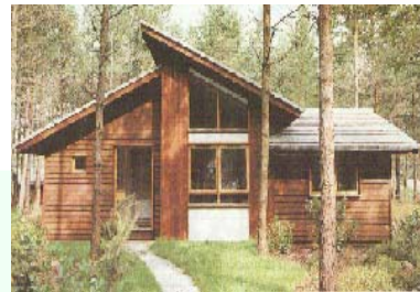
Oasis Holiday Village, Penrith

Where waste is transported by a third party on our behalf, it is only carried by another registered waste carrier and disposed of at a registered tip.