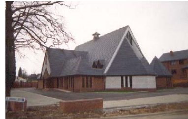
St Barnabas Church, Swanland