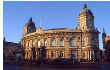
Town Docks Museum, Hull