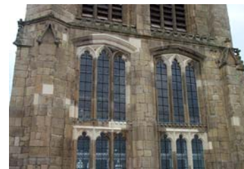
Holy Trinity Church, Hull