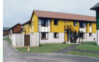
Butlins Funcoast World, Skegness

Current work includes a Partnering project with Humberside Police Authority to produce 24 Local Police Team bases. With ERYC and Housing 21, an Extra Care Housing Scheme in Bridlington, and in Hull, a regeneration project on East Park.