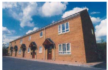
Wykeham Street, Scarborough