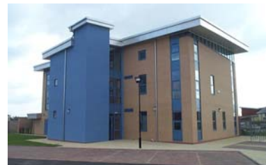
Family Resource Centre, Hull