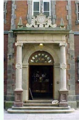
Scarborough Town Hall

Current projects include restoration work on Selby Abbey and further work at Holy Trinity Church, Hull.